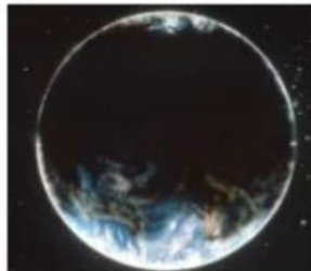
Graphic of Earth entombed by radioactive dustclouds after nuclear use (source IPPNW)

... humanity faces extinction if we do not pull back from the insane military-industrial growth and dominance of our lives and economies.